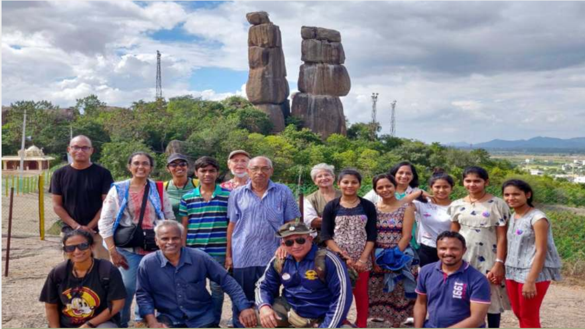
Rock Walkers at Madikonda