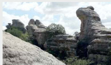
Rock Formations at Pandavulagutta