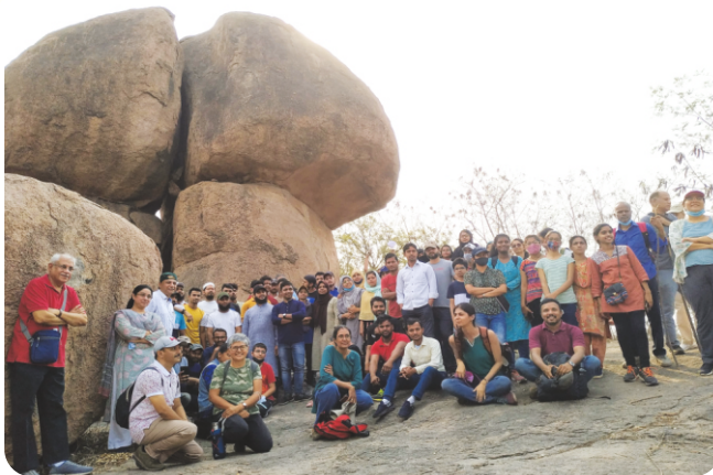
Group at Pathar Dil