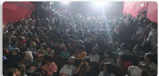
Enthusiastic crowd at launch of "Other Kohinoors"