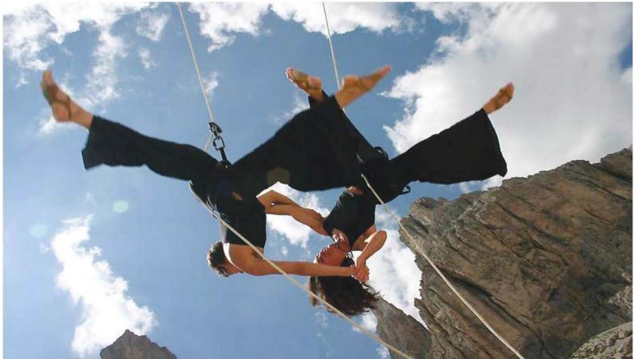
Bandaloop Dance Troupe in Action

The ANNUAL GENERAL BODY MEETING (AGM) of the Society took place on August 28, 2009 at the Jubilee Hills International Centre. The Minutes of the Meeting are enclosed to this Newsletter for Members.