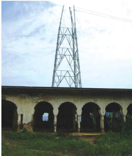
View of Transmission Tower behind Moulali Dargah

The 2000 feet high great rock dome of Moulali is 2,500 million years old – the same age as the fascinating balancing granite boulders of the Deccan.