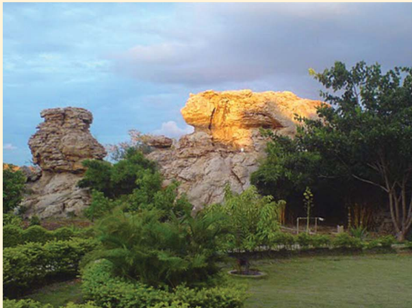
Oravakal Rock Park