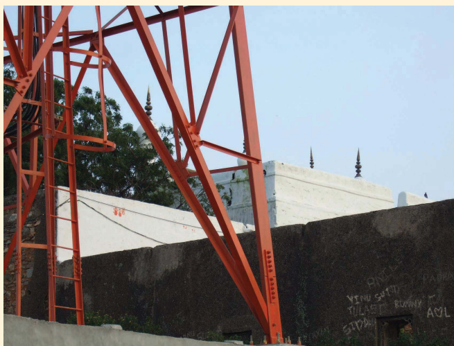
Transmission Tower Moulali