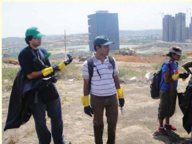
Googlers in action