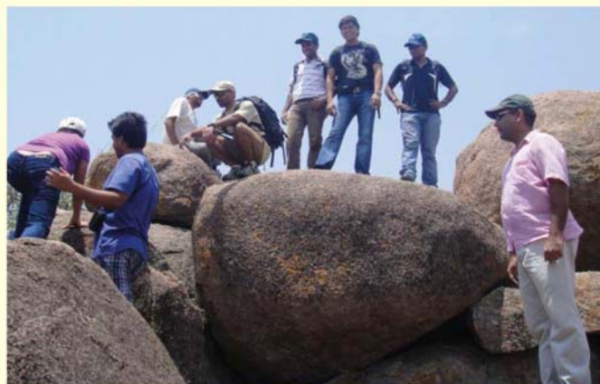
GoogleServe reaches new heights!

(An excellent example of a personal contribution towards a better environment that can be followed by environment enthusiasts.)