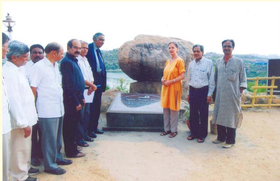
Members of HMDA's Heritage Conservation Committee unveil a plaque at the Heritage Rock Precinct "Hillocks around Durgam Cheruvu".