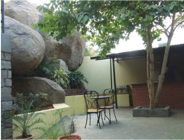
Truffles Restuarant & Cafe, Road No.10, Jubilee Hills