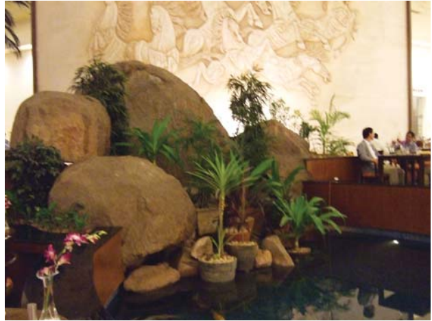
Lobby, Hotel Taj Residency, Banjara Hills

There are other Hotels where rocks have been made use of, adding to the aesthetics of the space.