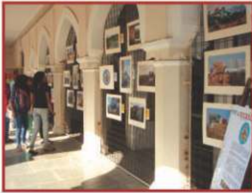
Display of participants' works from the Photography Workshop at the Hyderabad Literary Festival, Hyderabad Public School