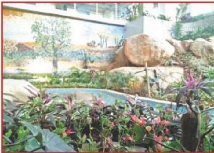
Sunken "Rock Garden" in L.V. Prasad Eye Institute

It is heart warming for us rock lovers to see the lengths or rather the depths that the L.V.Prasad Eye Institute has gone to preserve the Deccan Rocks in the lobby area of the new block . Having taken the trouble to investigate the age of the boulders that were unearthed from the land where the building is now situated the management had the rocks dated and incorporated into the landscaping.