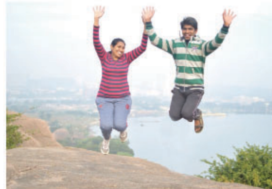
Enjoying the launching rock pad !

500 adventure enthusiasts relished the rocky Khajaguda area and enjoyed all the adventure activities such as zipling, rapelling, trail biking etc. The beat boxing, poetry and music by NRB- Nations Rock Beat with the added attraction of a magic show by hearing impaired magician Ravi Chandra kept the audience entertained. As always Friends of Snakes held the rapt attention of kids and adults alike breaking popular myths and displaying these oft dreaded reptiles.