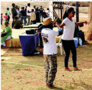
Doing the balancing act