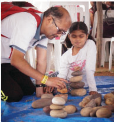
Rock balancing - a family treat