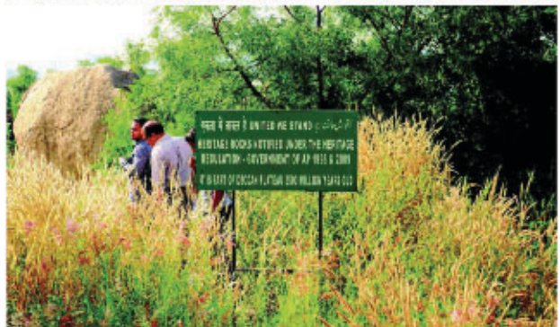
Heritage Rocks on MANUU Campus