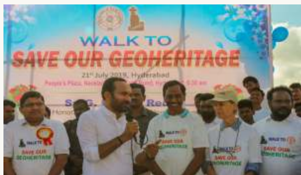
Shri G. Kishan Reddy addressing the Runners

The Earth Scientists August 2019 Newsletter carried the Society's feature “Saving the Secular Hillock of Khajjaguda.” The endangered Heritage site will hopefully get visibility and gain support from it's 600 odd member scientists spread across the country. The article can be viewed on www.earthscienceindia.info in the popular section.