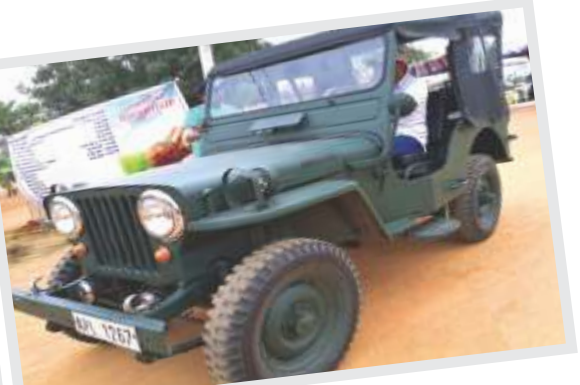
1948 Willy's Jeep