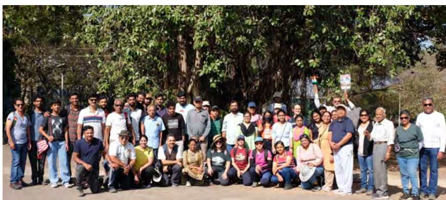
Photos of Hampi